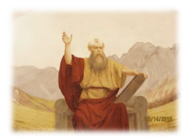
Mural of Moses in the Grotto of Moses.