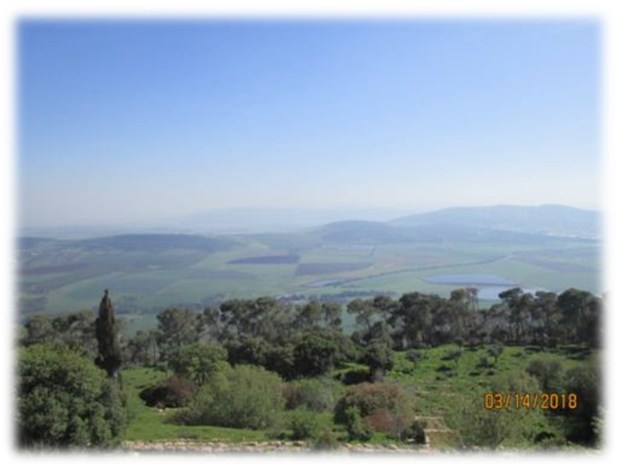
View of the Jezreel Valley from the roof of the Church of the Transfiguration. The Jezreel Valley is known as the "Breadbasket of Israel;" appropriately Jezreel means, "God sows." Many battles have been fought in the Jezreel Valley including that between Israel and the Canaanites where the prophetess and judge of Israel, Deborah, and her general Barak destroyed the armies of Sis'era including his nine hundred chariots and charioteers. (Judges 4: 4-24)