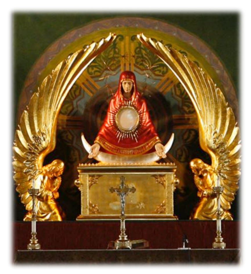
Mary Ark of the Covenant Monstrance

So let us not be silent of Christ's Transfiguration or of His victory over sin and death, but let us all share the Good News of our Bridegroom, the seed of the Woman, and savior of our souls.