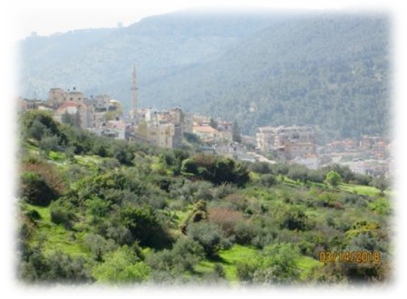
View from the bus while on the road to the Church of the Transfiguration.