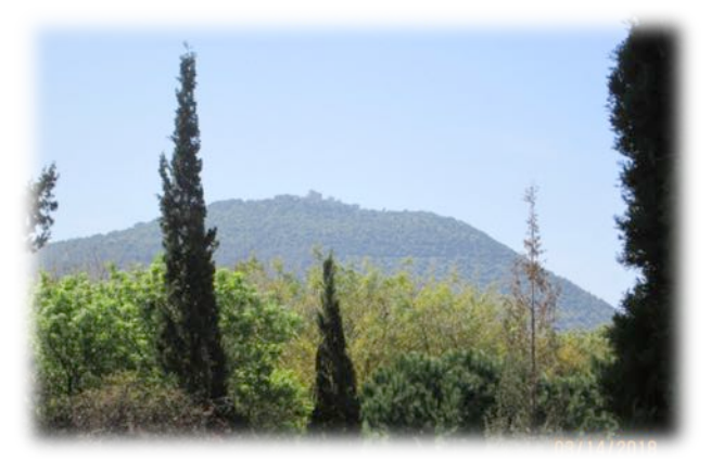
Mount Tabor. Note: the structure on top of the mountain is the Church of the Transfiguration.

When the Crusaders conquered the region they also built a church in honor of the Transfiguration on the ruins of the much older Byzantine ruins, but this church was also destroyed, this time by the Mamluk Turks. Four hundred years would pass in which Christians were not allowed to visit the site, then in the 17<sup>th</sup> century the Franciscans were given permission to settle there. Ruins of both the Byzantine and Crusader era churches were discovered and during the 19<sup>th</sup> century construction began on a new church complex which would become known as the Church of the Transfiguration. The Church contains three grottos which date back to the Crusader church. These grottos, also known as the three tabernacles, commemorate the three tabernacles that Peter wanted to build, one for the Master (Jesus), and one for Moses and the other for Elijah.